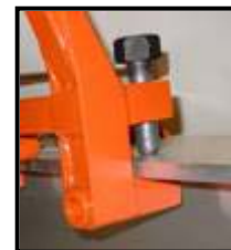
Top Mounted Bolts

* System shall be inspected before and after each use by a qualified person. In the event of a fall, energy absorber, cable and lifeline hardware must be replaced.