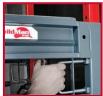
QUICK AND EASY HEIGHT ADJUSTMENT