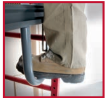
SAFECLIMB RUNG STEP